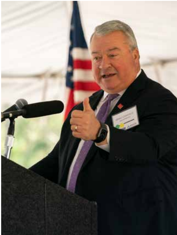
Commerce Secretary Greg Canfield speaks at a groundbreaking ceremony for the Alabama Graphite Products processing plant in Coosa County, one of the largest projects announced in rural Alabama during 2021. The first phase involves an investment of $202 million.

I'm proud to report that economic development activity in Alabama's rural counties was energetic during 2021, with solid growth projects fortifying these areas with new investment and jobs — along with an invigorating economic spark.