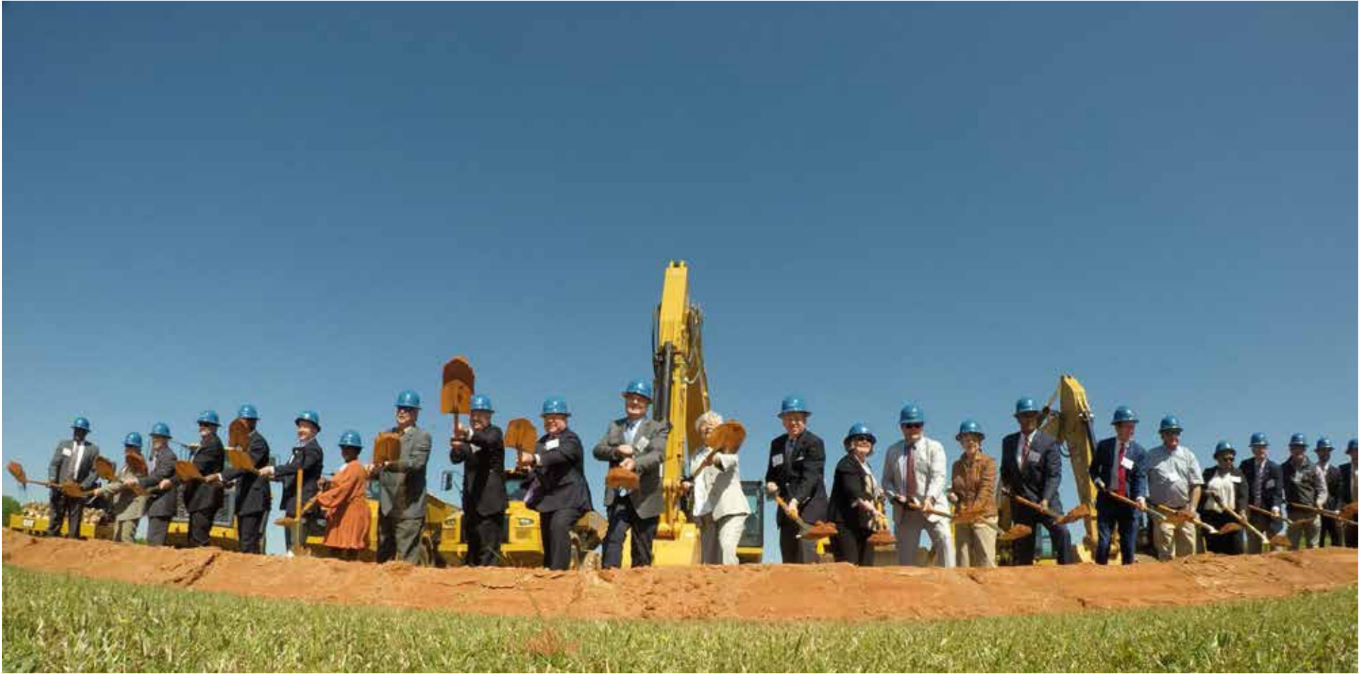
Westwater Resources and its Alabama Graphite Products subsidiary are pumping $202 million into the first phase of a project to build a graphite processing plant in Coosa County.