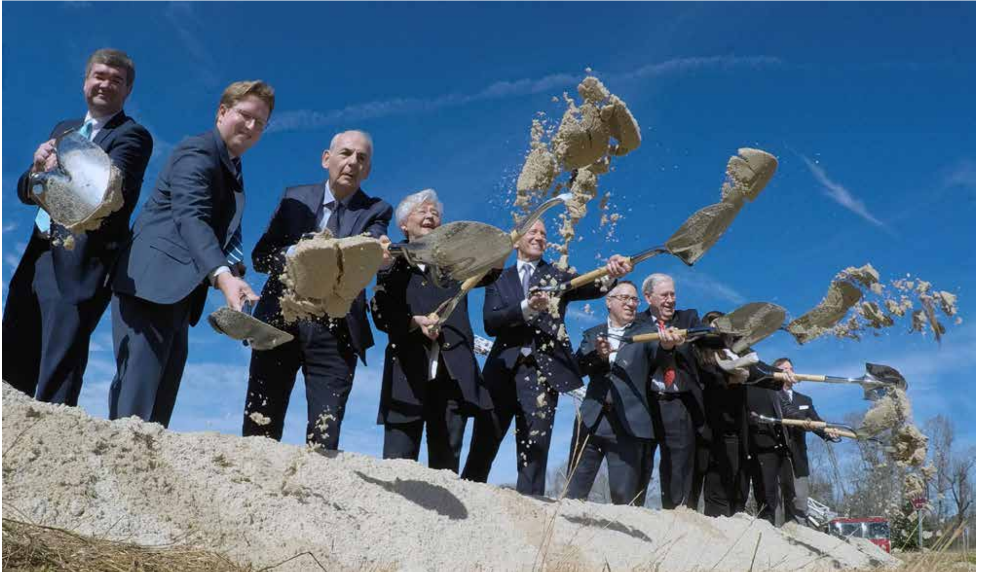
Commerce data show that 2021 was a strong year for economic development in Alabama's 40 "targeted" counties, with new capital investment of $1.7 billion in projects that will create more than 1,600 jobs in rural areas.