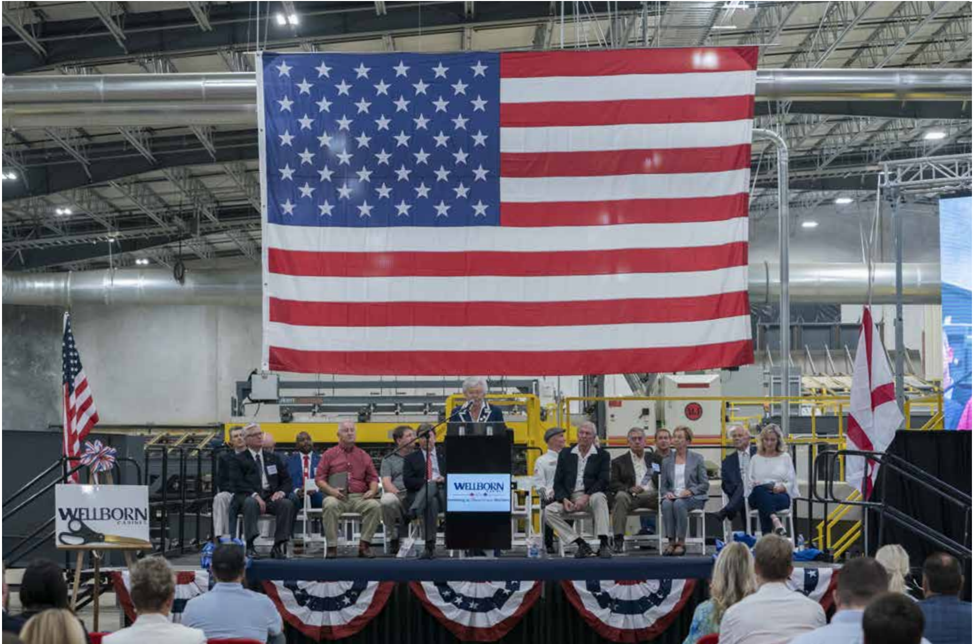
Wellborn Cabinet is creating 200 jobs at its Clay County production plant, where it is adding a planer mill and paint facility, along with new health care and day care facilities. The project is valued at $15 million.