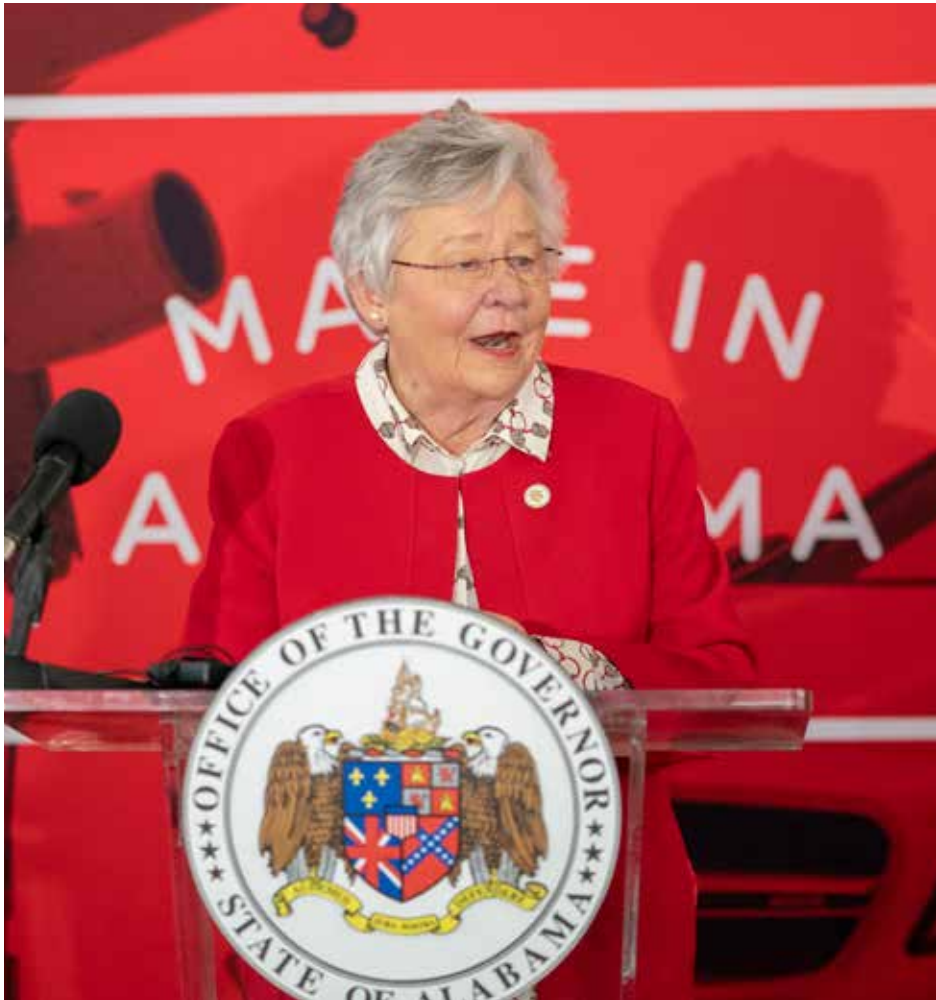
Governor Kay Ivey says she is committed to facilitating growth through strategic economic development in Alabama’s rural areas.

Having grown up in Wilcox County, I’m very familiar with the economic challenges that Alabama’s rural communities face every single day. At the same time, I’m also fully aware that these areas have a lot to offer companies looking to expand their operations, even if that fact is not always recognized.